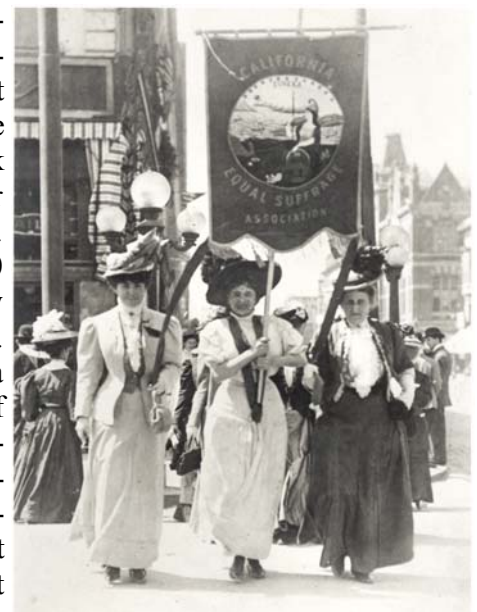
California Suffrage Parade, 1911. Western women and men lead the nation in establishing equal suffrage

The right to vote was considered the most radical of the endorsements and became the primary objective of the campaign. For the next 72 years, thousands of determined women circulated countless petitions and gave suffrage speeches in churches, convention halls, meeting houses and on street corners. They published newspapers, pamphlets and magazines. They were harassed