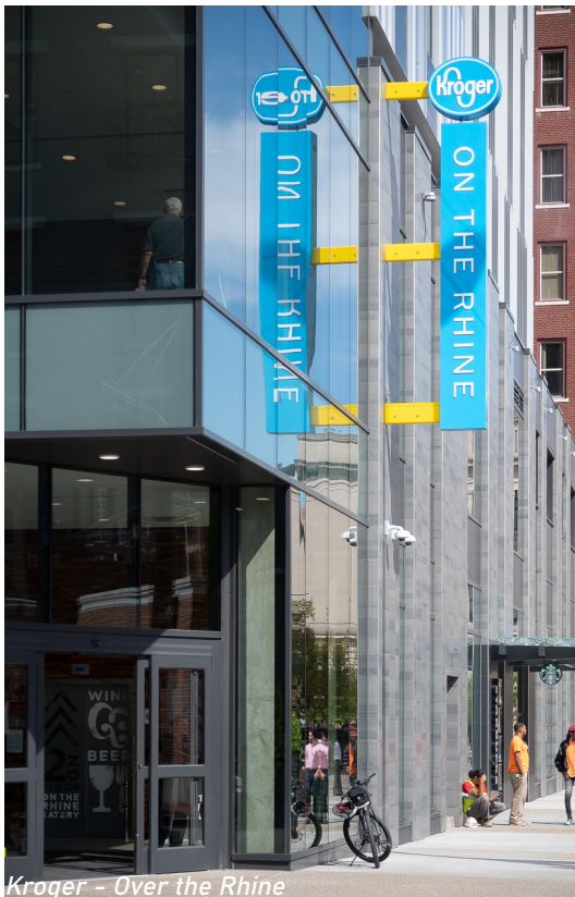
Kruger - Over the Rhine

Since the recommendations in this document come from a year-long process that received much input from citizens, business leaders, local governments and other experts, we should not ignore the results of the process. While there will be new problems to solve as a result of the pandemic, many of the problems that are addressed in this document were around before the pandemic and will still be around and likely exacerbated following the retreat of the virus. When the impact of the "Great Lockdown" is better known, the County can revisit this document and update it with new ideas and new strategies. In the meantime, we look to this document to guide our efforts on the problems and opportunities that we can impact.