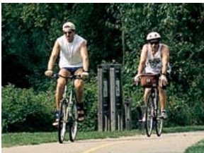
Autumn Bike Tour

On October 1, the county's Park District will begin celebrating 75 years of great parks. The celebration will begin with